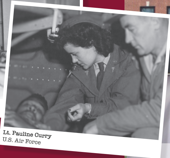
Lt. Pauline Curry U.S. Air Force